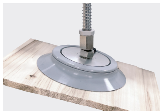
* HKB case