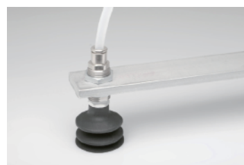
* HSGE case